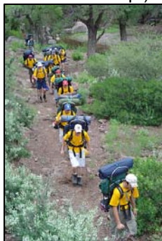
Enjoy over 50 miles of rugged trails at BTSR.

O t h e r p r o g r a m i n c l u d e s n a t u r a l w a t e r r e s o u r c e s, w e a t h e r, a n d g e o l o g i c a l s t u d i e s.